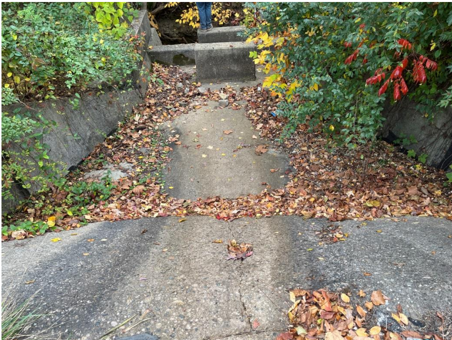
Top: Auxiliary spillway concrete chute; note condition of concrete and vegetation growth in cracks