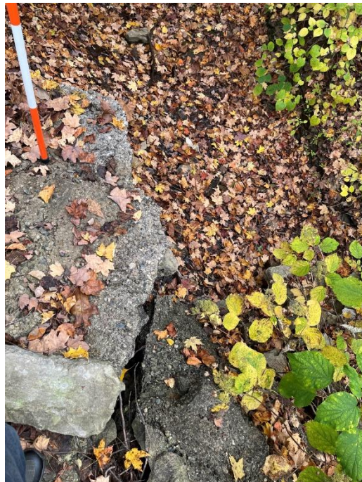
Top: Auxiliary spillway concrete chute; note condition of concrete (cracking, spalling)