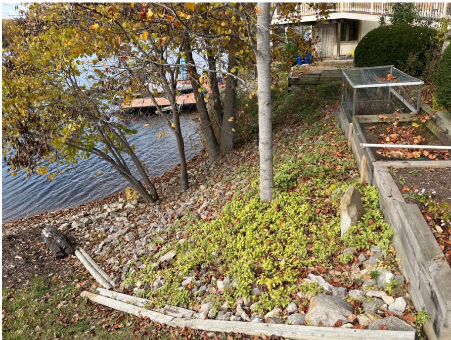
Top: Upstream slope from left side; note trees on left abutment