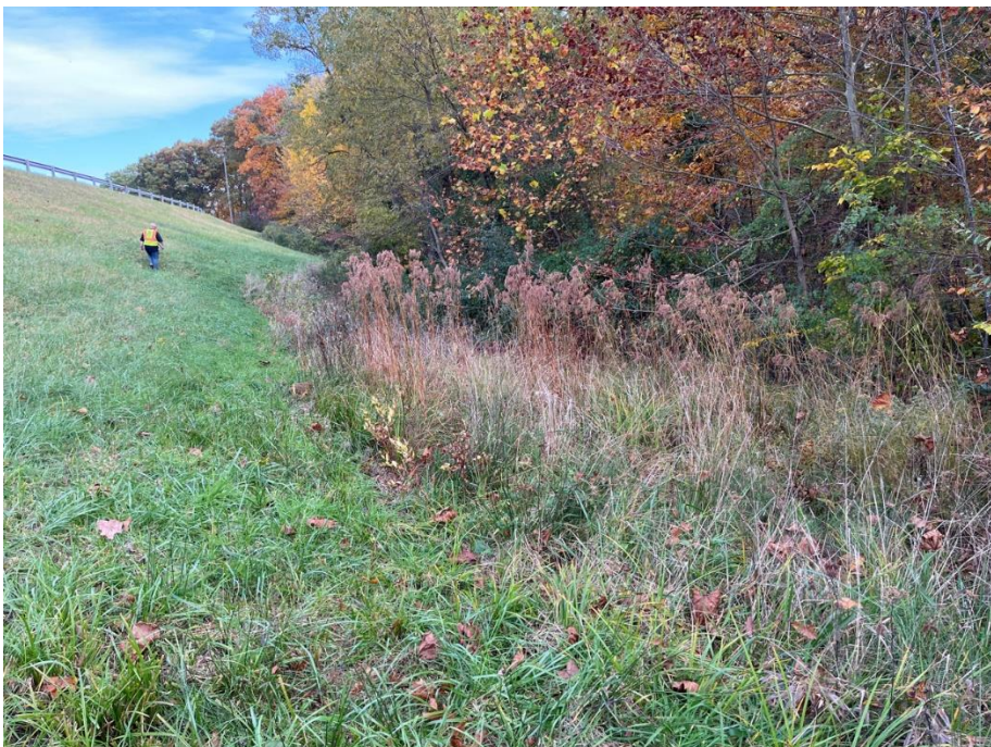
Top: Downstream slope at “tie-back” section; note 40ft by 15ft wet area observed near toe with tall grass